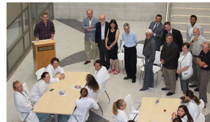
Students share lunch and conversation with donors.

Think of those you travel with on a journey. Maybe it's your favourite companion, a friend or family member or a group of wonderful people. The people who share their time and knowledge with the students at the College of Dentistry are among the students' favourite friends. Lifesavers in every way! The college is privileged to have 59 fabulous part-time faculty companions. Other special friends including guest lectures, over 50 volunteers who help with admissions annually and those within the college who work and volunteer for the students'