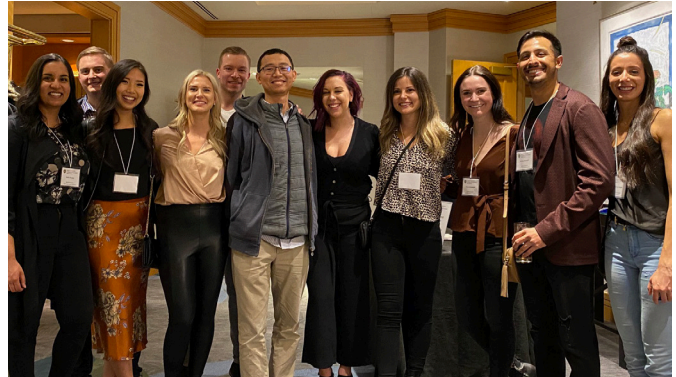
Alumni from across Canada joined us in Vancouver in March, like the Class of 2018 pictured here.