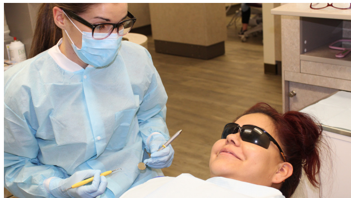
Saskatoon West dental clinic